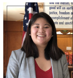
Auxiliary Unit 404 sponsors attendees to Missouri Girls State.

We are one of the nation's most prominent supporters of veterans, military, and their families. The ALA helps to advance the mission of The American Legion. From helping to draft the GI Bill in 1944 to advocating for veterans on Capitol Hill, the nonpartisan American Legion Family has been instrumental in advancing legislation that improves the quality of life for our nation's veterans.