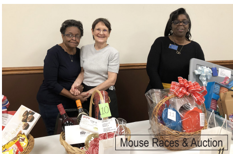
Mouse Races & Auction

You can participate in school supply drives and other activities to support our local schools, assemble care packages for our troops or homeless veterans, volunteer at veteran service events, your local VA medical center, or Veterans Home, and much more.